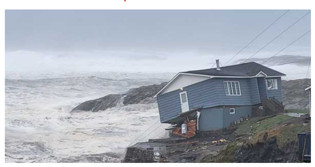
Families across Nova Scotia, Prince Edward Island, New Brunswick, Newfoundland and Labrador, and Quebec are facing devastation of their homes and neighbourhoods, displacement, injury, and other damaging effects of Hurricane Fiona.