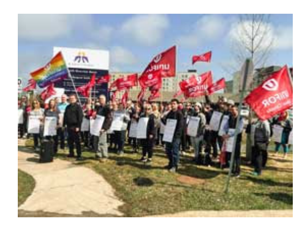
Workers and government spent the past two weeks at the Ontario Superior Court, presenting arguments against and in support of Bill 124. What's next?