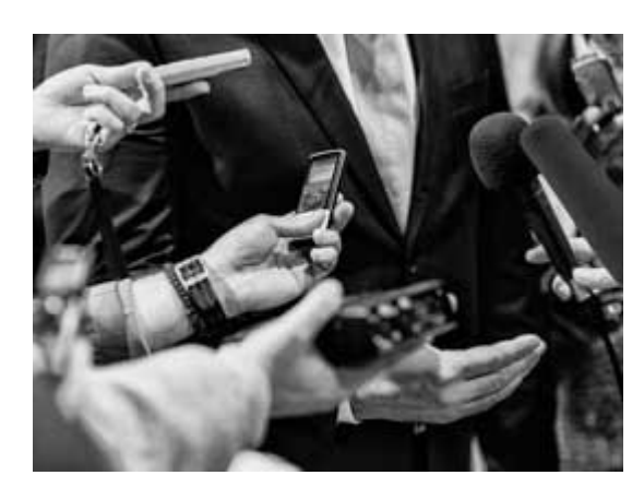
Unifor stands with journalists and independent news organizations on World News Day, a day where many recognize the importance of fact-based journalism. Read our statement.