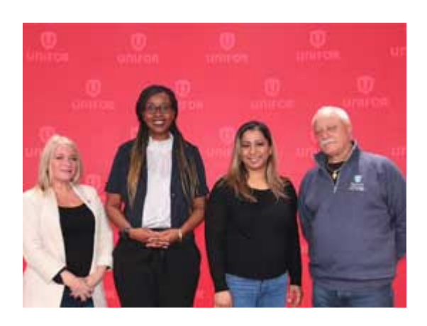
Registration for the next Ontario Regional Council to be held in-person at the Sheraton Centre Toronto, from Dec. 2-3, 2022, is now open.